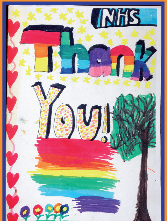
This lovely card was sent to MedEquip4Kids from the children's ward at Furness General Hospital